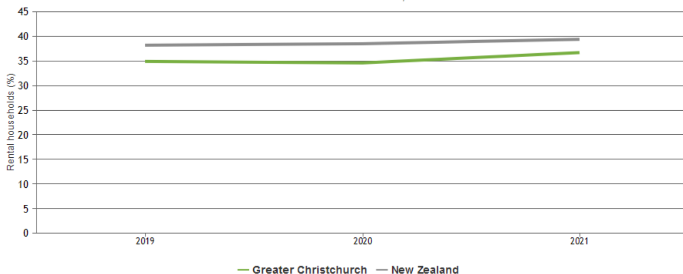
Figure 2.2: Proportion of renter households that spend more than 30% of gross household income on housing, in greater Christchurch and New Zealand, 2019–2021

The figure shows that the proportion of renter households in greater Christchurch spending over 30 percent of their gross household income on housing costs was relatively stable between 2019 and 2021 (34.6 percent in 2019, 36.7 percent in 2021). By this measure, for the period 2019 to 2021, spending on rental housing has generally been lower for greater Christchurch renters compared with renters in New Zealand overall.