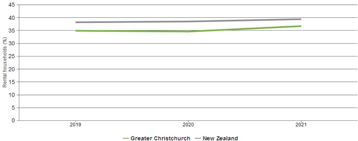
Figure 2.2: Proportion of renter households that spend more than 30% of gross household income on housing, in greater Christchurch and New Zealand, 2019–2021

The figure shows that the proportion of renter households in greater Christchurch spending over 30 percent of their gross household income on housing costs was relatively stable between 2019 and 2021 (34.6 percent in 2019, 36.7 percent in 2021). By this measure, for the period 2019 to 2021, spending on rental housing has generally been lower for greater Christchurch renters compared with renters in New Zealand overall.